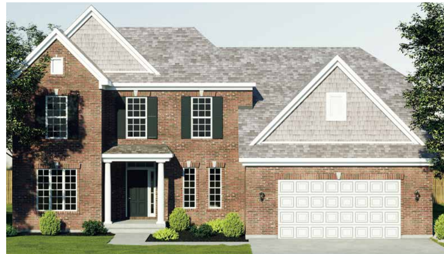
Elevation 1, Front Garage

Stories: 2 Sq ft: 3,086 Bedrooms: 4 Full baths: 3 Half baths: 0-1 Garage: 2-3